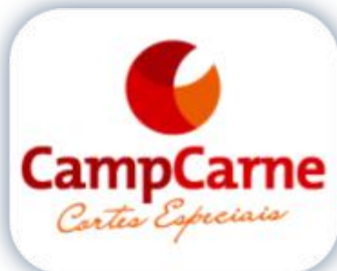
Special Cuts Meats